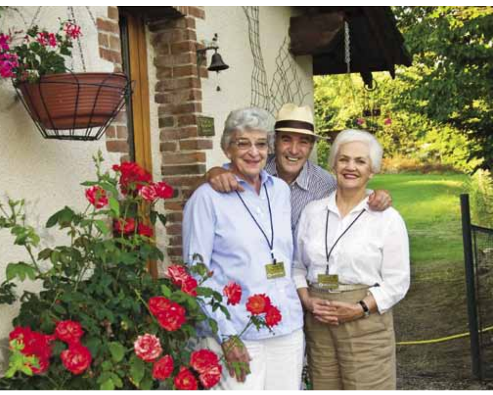
Cruising Burgundy & Provence to the Cote d'Azur

Prices are per person for 13 days, based on double occupancy, and include meals and included tours as specified in the It's Included box.